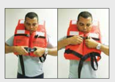
Step 3 Clip together both buckles of the lifejacket.